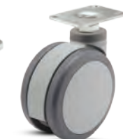
Antistatic available, see page 102-103.

Special colors available. Consult factory.