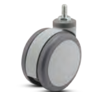
Antistatic available, see page 102-103.

Special colors available. Consult factory.