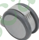
Undercover shield for ultimate protection.

Special colors available. Consult factory.