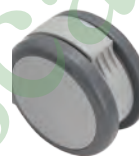
Undercover shield for ultimate protection.

Special colors available. Consult factory.