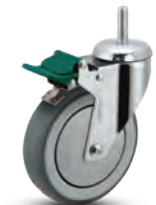
Direction Lock Green pedal.

Stems ship with a loose bolt for easier alignment of the directional lock.