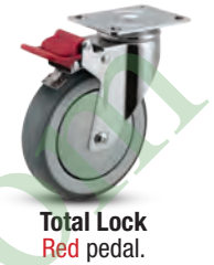
Total Lock Red pedal.