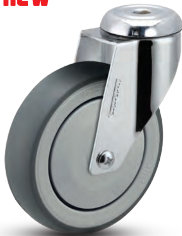
Thermoplastic rubber wheel SX-05TPX-125-SW-HK01