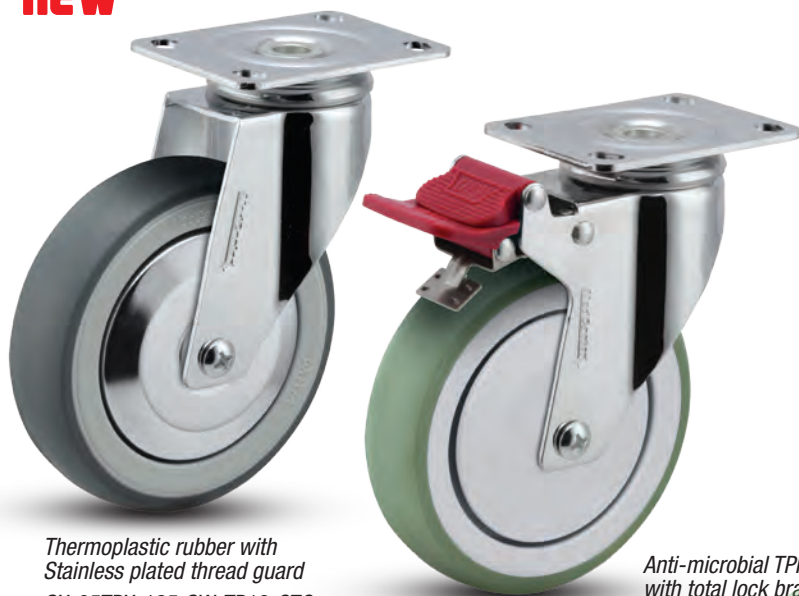
Thermoplastic rubber with Stainless plated thread guard SX-05TPX-125-SW-TP13-CTG