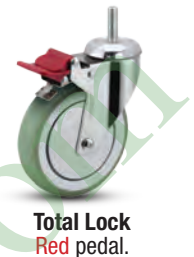
Total Lock Red pedal.