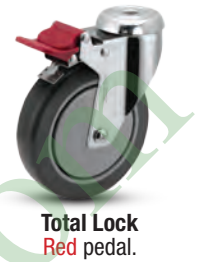
Total Lock Red pedal.