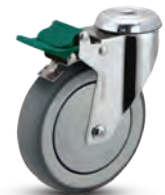
Direction Lock Green pedal.