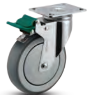
Direction Lock Green pedal.