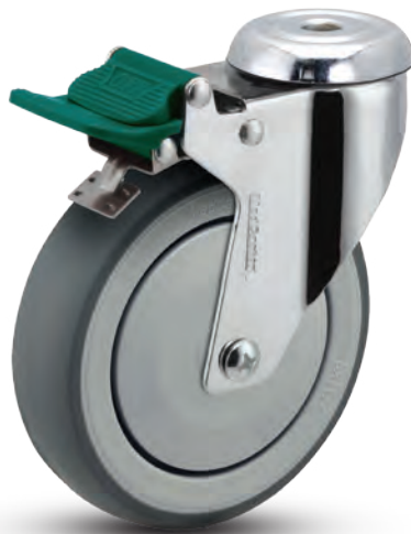
Thermoplastic rubber wheel with direction lock SX-05TPX-125-DL-HK01