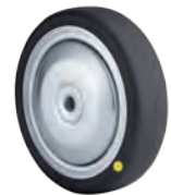
32C Electrically conductive natural rubber on steel rim (To order change B to A)