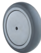
35K TPR (in chart at right)