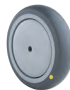
35K Electrically Conductive TPR (To order change R to A)