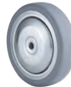
32C Natural rubber on steel rim (in chart at right)