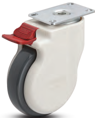
Total lock model CP-05PYP-125-TL-TP13W