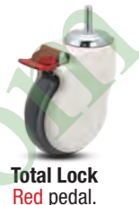
Total Lock Red pedal.