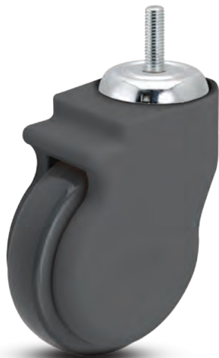
Free swivel model CP-05PYP-125-SW-TS02G

HOLLOW KINGPIN MODELS FREE SWIVEL • TOTAL LOCK • DIRECTION LOCK