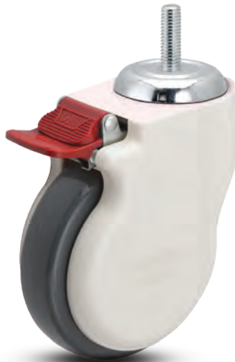
Total lock model CP-05PYP-125-TL-TS02W