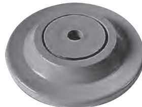
Rolling Bumper RB-5 & RB-7

3-1/2" diameter bumper fits 1" O.D. round (TB3.5R) or square (TB3.5S) tubing