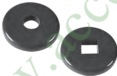
Tubing Bumper B-3-1/2

Grey corner bumper for mounting on flat surfaces; ends of legs may be cut at notched area to make square ends, with steel inserts. 7/8" thick x 1" high x 3-1/8" long from inside corner.