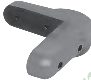
Corner Bumper CB-10

Grey corner bumper for mounting on flat surfaces. 7/8" thick x 1" high x 2-5/8" long from inside corner.