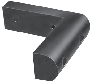
Corner Bumper CB-8

Grey end bumper generally used on the ends of tubular handles; 3-1/4" diameter with steel insert for 5/16" bolt.