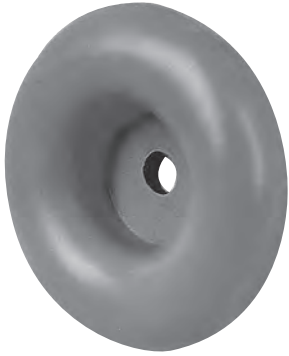
End Bumper EB-1

Grey end bumper generally used on the ends of tubular handles; 3-1/4" diameter with steel insert for 5/16" bolt.