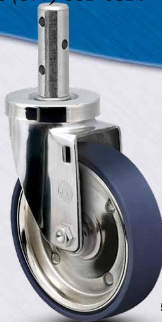
5-S32-113P (shown in photo)