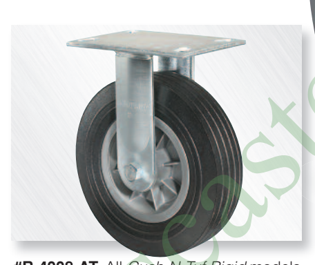
#R-4008-AT. All Cush-N-Tuf Rigid models feature rugged plate steel construction, with legs continuously welded inside and outside to mounting plates that match the bolt patterns of the swivels.

The casters-cold forged double ball race swivels and matching plate steel rigidsare bright zinc plated to complement the natural corrosion resistance of the Ace-Tuf® wheel. (For specifications of Ace-Tuf® wheels only, see catalog page 85.) Check the attractive prices, too.