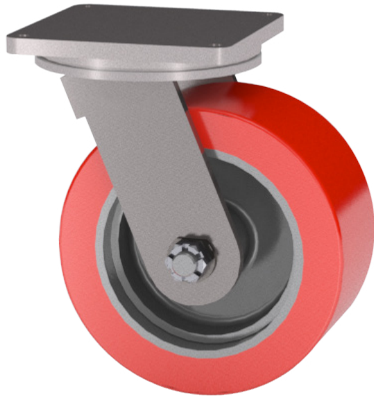
Item Shown: 99-18901-69-1