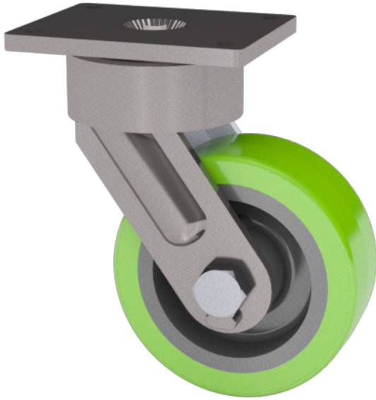
Item Shown: 87-08302-43-1