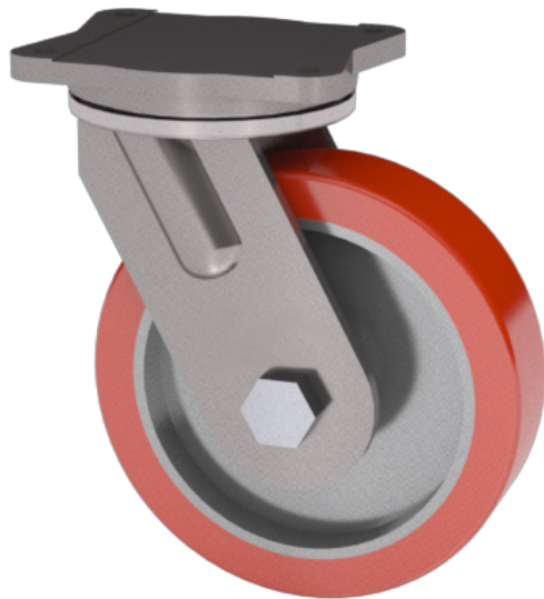
Item Shown: 85-12501-65-1