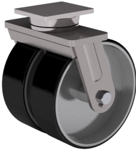
Item Shown: 2-81-14004501-60-1