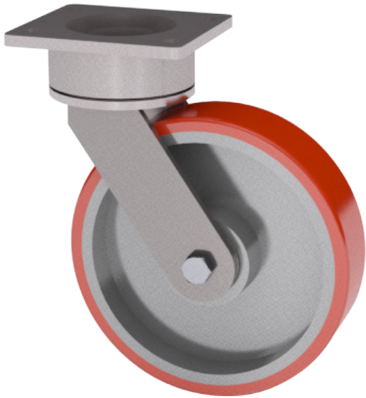
Item Shown: 57-8002002-91-1