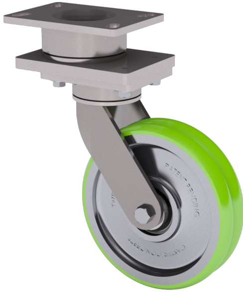
Item Shown: SP13062321