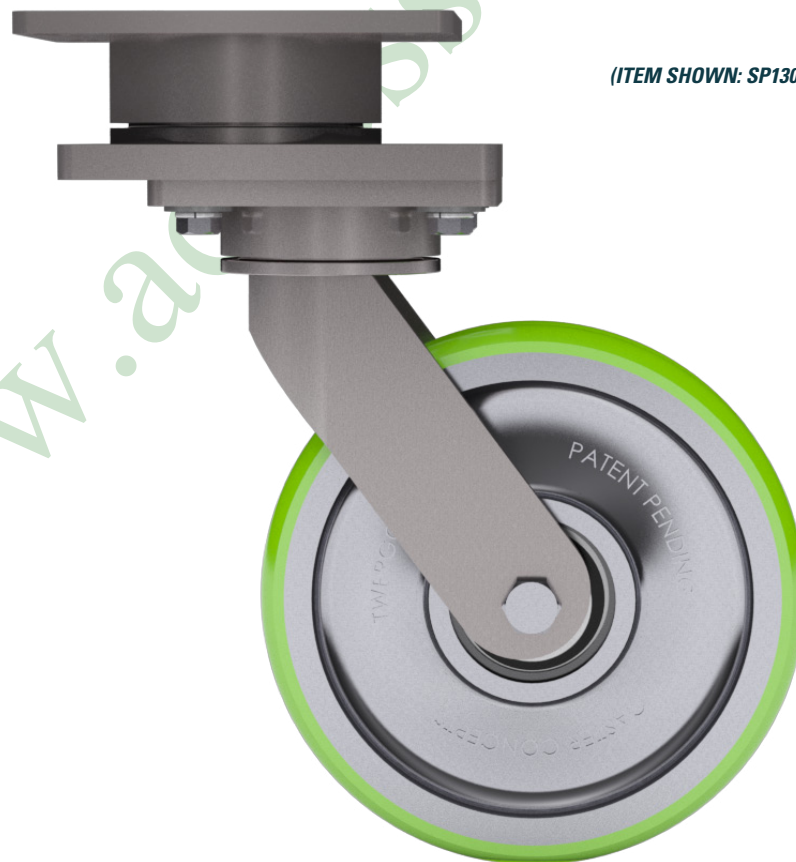
(ITEM SHOWN: SP13062321)

Capacity listed is for manual operation. For powered operations, consult factory. All dimensions are in inches. All weights are in pounds.