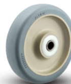
XA Prevenz™ Polyurethane on Polypropylene

The EPA registered and FDA compliant antimicrobial additive used in Prevenz™ wheels is designed to suppress the growth of a variety of destructive and odor causing microbes including bacteria, molds, mildew and fungi. These wheels are suitable for a variety of applications including medical equipment, food equipment, pharmaceutical, chemical, meat & poultry, processing plants and more. To order add "PREV" to end of caster number.