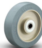
XS Prevenz™ X-traSoft Rubber Flat Tread